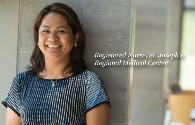
Registered Nurse, St. Joseph's Regional Medical Center