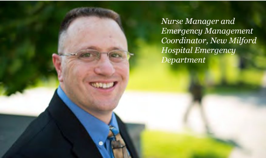
Nurse Manager and Emergency Management Coordinator, New Milford Hospital Emergency Department