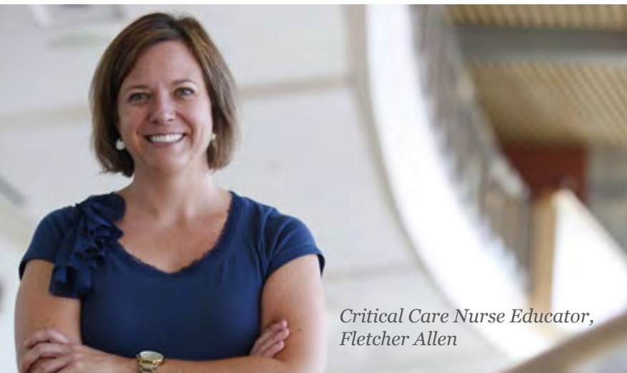
Critical Care Nurse Educator, Fletcher Allen