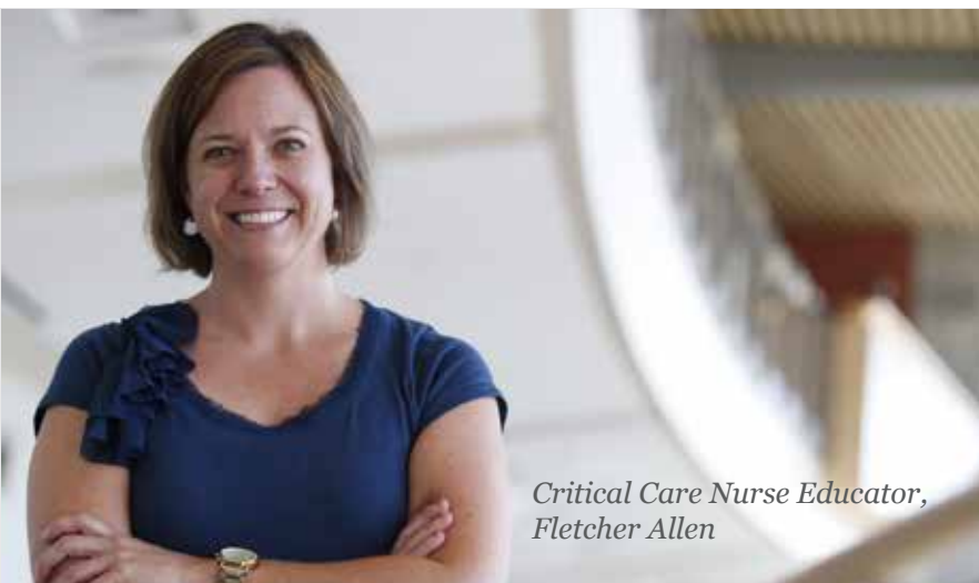
Critical Care Nurse Educator, Fletcher Allen