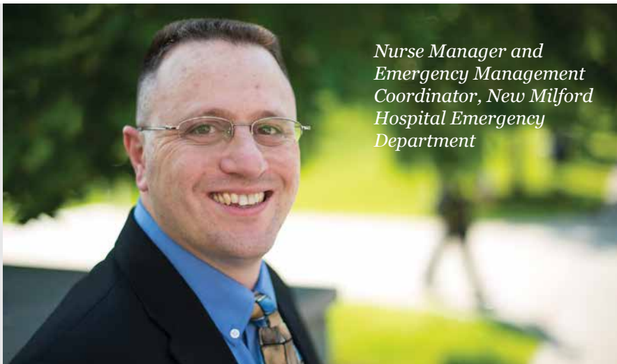
Nurse Manager and Emergency Management Coordinator, New Milford Hospital Emergency Department