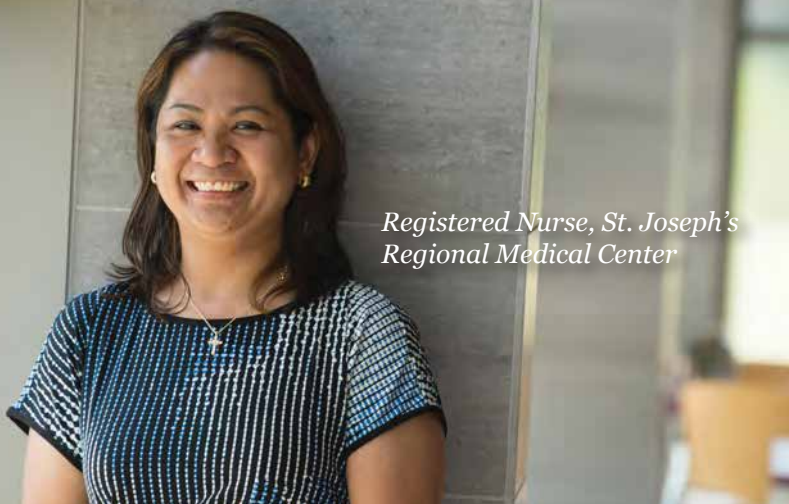
Registered Nurse, St. Joseph's Regional Medical Center